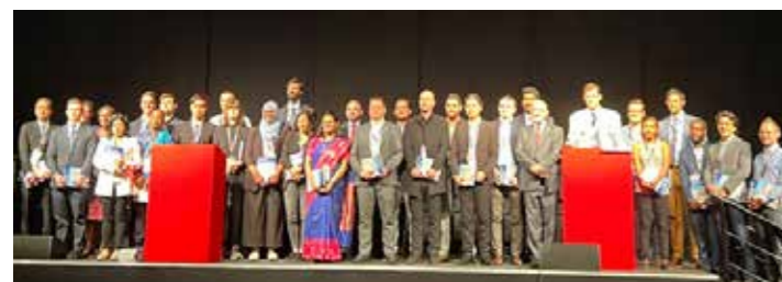
Photo 4: Closing Ceremony at the IFSSH Congress. All the Fellows receiving their certificate.

The IFSSH Congress London 2022 started the week beginning 6th June. It has been one of the first face-to-face international meetings in hand surgery for many of us. The Fellows were able to enjoy a free registration to hear all the wonderful presentations, to attend the gala dinner, to network and for many of them, to present their own research. The Fellows were presented at the closing ceremony, where the Fellowship Program was recognised as being a jewel in the crown of the London 2022 congress, and we all hope the legacy of it continues.