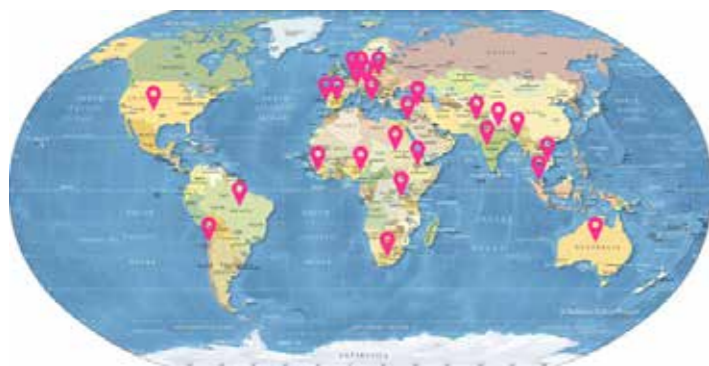
Map 1: The country of origin of the IFSSH fellows.