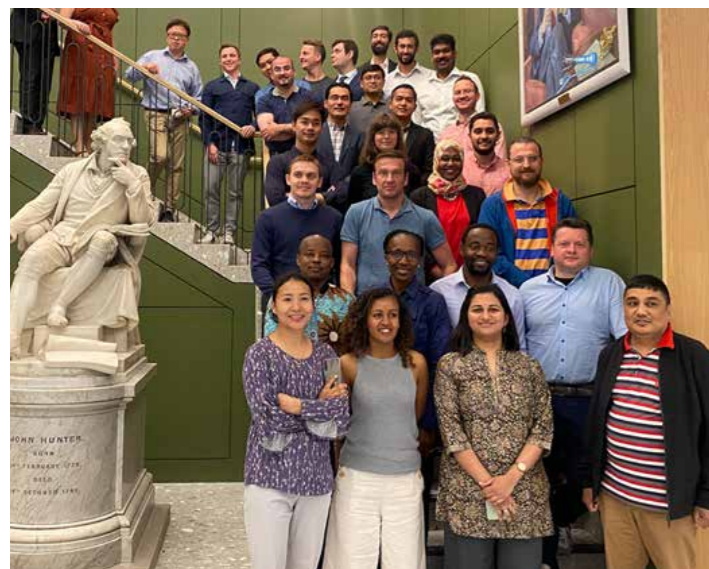
Photo 1: Group shot of the IFSSH fellows at The Royal College of Surgeons England.

The IFSSH Congress in London in June 2022 saw the launch of the inaugural IFSSH Fellowship Programme. Thirty young hand surgeons from around the globe visited UK hand surgery centres of excellence for two weeks and then travelled to London to attend the Congress